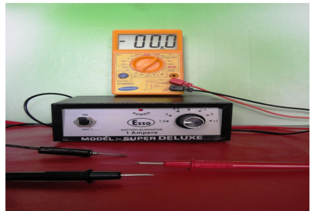
Figure 1: Electroejaculation apparatus.

Position I: A single cathode probe was attached to the right side inner coxa of the swimming peddles and an anode was attached to the left side inner coxa of the swimming peddles (Figure 2).