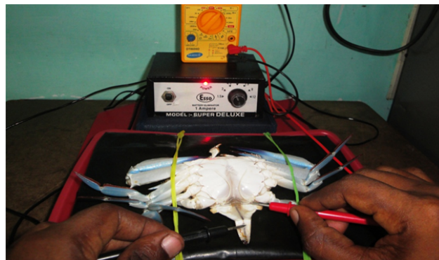
Figure 4: Electrode placement in position III.

Among six positions the bilateral ejaculation (extruding spermatophores in both sides) was occurred only in positions I and VI. In all three trials the animals were bilaterally ejaculated 100% in