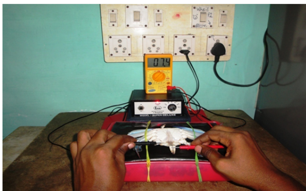
Figure 3: Electrode placement in position II.

position VI. However in position I the percentage of bilateral ejaculation was 66.66 in all three trials. In other four positions (II, III, IV and V) the ejaculation was happened unilaterally (extruding spermatophores in one side) especially in probe attachment side in all three trials. In positions II & IV all the animals were extruded unilaterally in all the three trials whereas in positions III & V the percentage of unilateral ejaculation was 66.66 & 83.33 in Trial I, 83.33% & 66.66% in Trials II & III respectively (Tables 1-3).