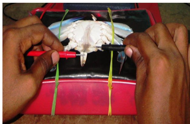
Figure 5: Electrode placement in position IV.