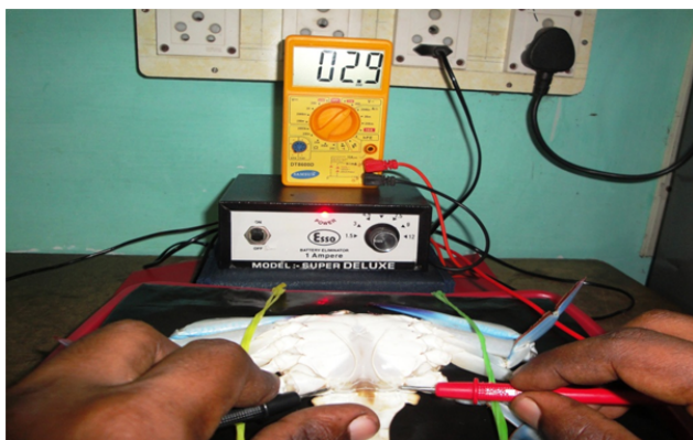
Figure 2: Electrode placement in position I.